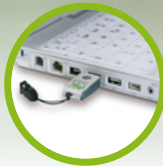
Insert MIC into any USB computer port to view your data: compatible with Windows and Mac.

The MIC is an innovative product that allows a person to organize, carry and maintain their personal medical history at all times. Designed to be attached to a keychain or worn around the neck, this lightweight, password protected 'plug and play' device inserts into a USB port on any computer for easy access by a patient, physician or emergency responder. MIC works with both Windows and Mac operating systems.